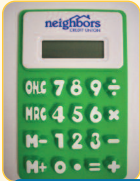
Flexible Calculator 8 Coins

Do you have a lot of Camp Cash coins saved? Now is the perfect time to come in and trade them for the new prizes we have available. Check out a few of our great, new prizes now available at all of our branches: