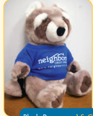
Plush Raccoon 15 Coins

Plus, you can still enjoy many of our previous prizes.