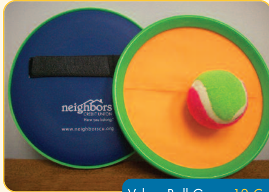
Velcro Ball Game 12 Coins